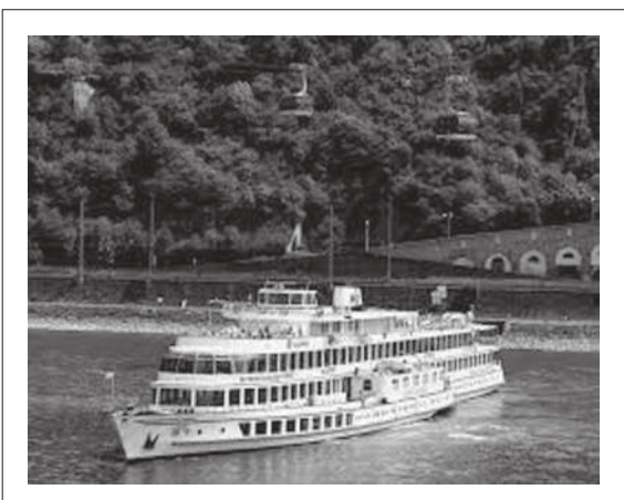
Fig. 2.1 for Question 2